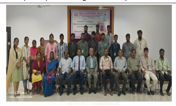
Gathered for a group photo